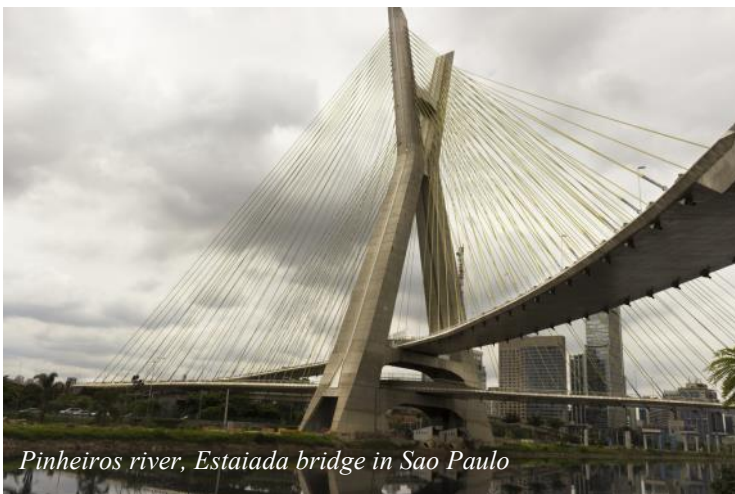
Pinheiros river, Estaiada bridge in Sao Paulo