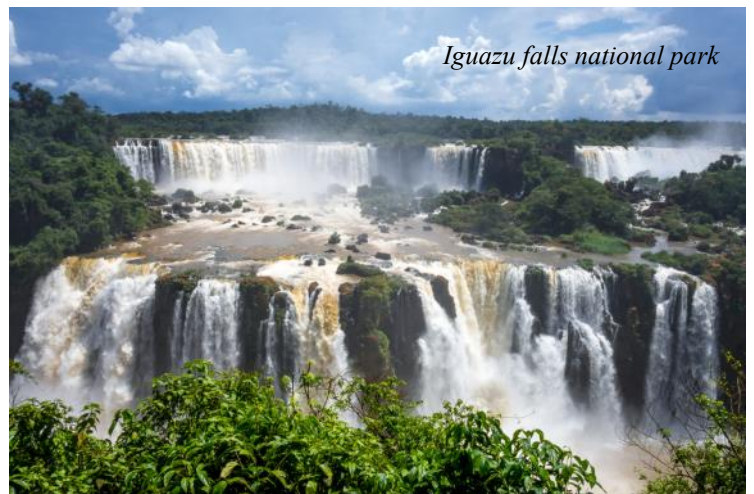
Iguazu falls national park

Today is all about the Argentinean side of the falls – perhaps a new country to tick off your life-list? We'll visit the Itaipu