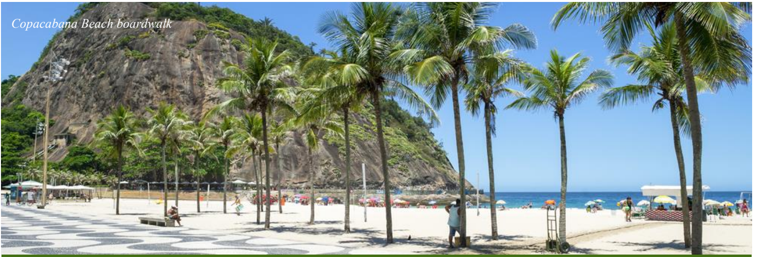
Copacabana Beach boardwalk