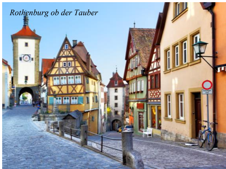
Rothenburg ob der Tauber