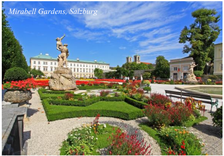
Mirabell Gardens, Salzburg