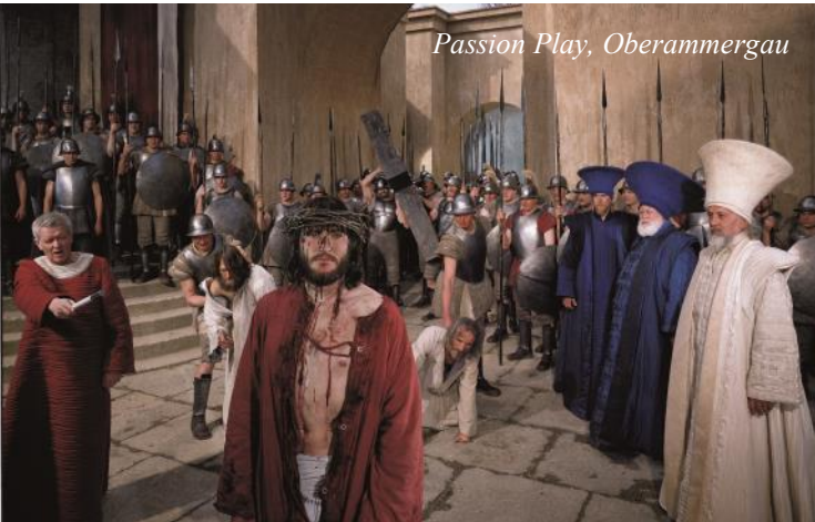
Passion Play, Oberammergau

Abbreviations for Meals B=Breakfast L=Lunch D=Dinner