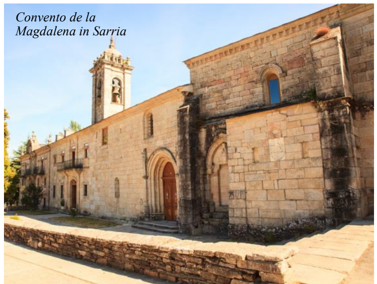
Convento de la Magdalena in Sarria

Day 7: Saturday, September 23, 2023 • Hospital de la Cruz to Palais de Rei Walk from Hospital de la Cruz to Palais de Rei (approx. 12 km or 7 miles) A day of delight! This short walk is mostly level and unchallenging, the perfect time to reflect on our intentions for this pilgrimage. B