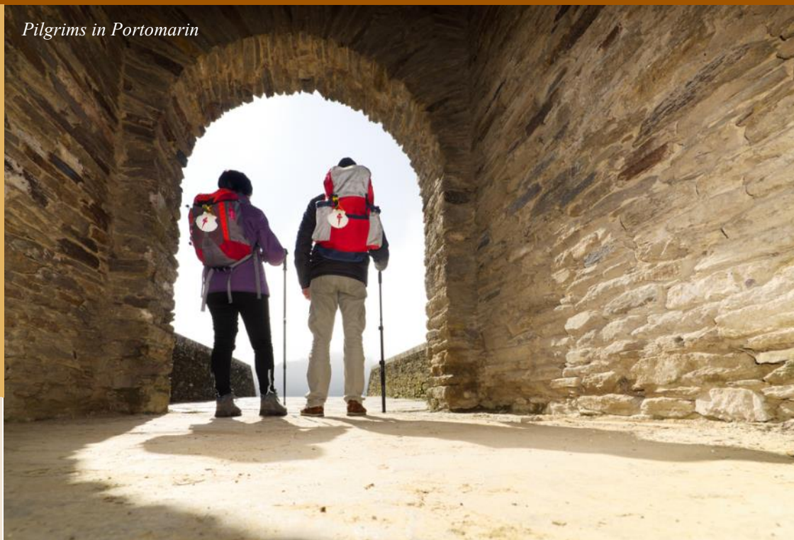
Pilgrims in Portomarin