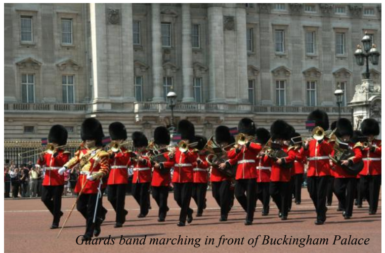
Guards band marching in front of Buckingham Palace

Lord Nelson Column , Westminster Abbey , and of course, Picadilly Circus . The afternoon is open for options, a time to explore on our own. London has a wealth of museums and many of them are free of charge. Not to be missed is the prestigious British Museum with its incomparable section of antiquities. Art lovers want to spend time in the Tate Gallery, one of the world’s greatest museums of art! Shoppers and non-shoppers alike would appreciate an hour or two spent exploring Harrod’s, the world’s greatest department store. Britain’s World War II “war room” has been preserved just as it was and is open to the public. The possibilities are endless! Tonight we celebrate our final evening in Britain with dinner at the original Hard Rock Cafe followed by one of London’s fine West End musicals! B/D