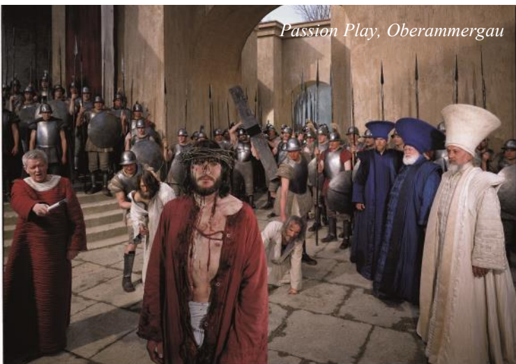
Passion Play, Oberammergau

Abbreviations for Meals B=Breakfast L=Lunch D=Dinner