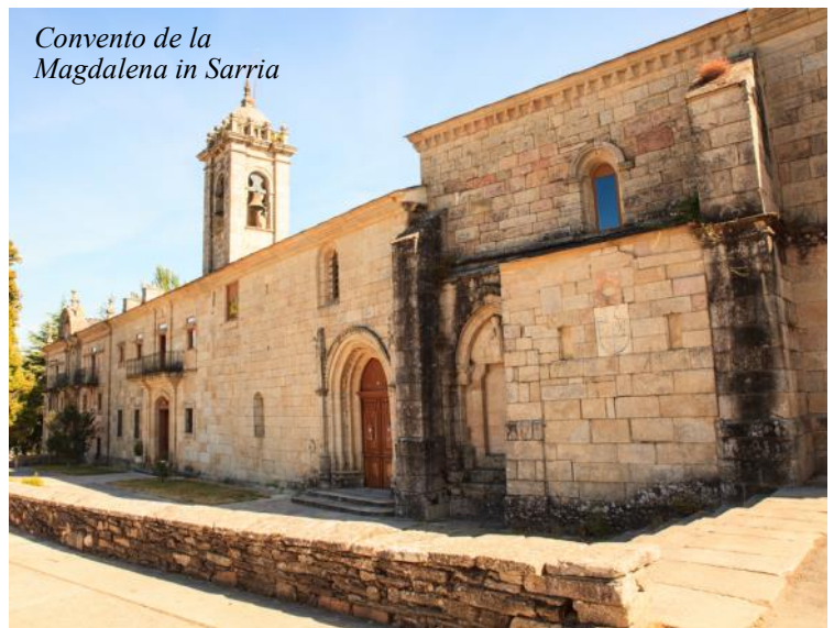
Convento de la Magdalena in Sarria

There are several small villages along the route, and the Romanesque church in Castromaier which is worth a short visit. B, L