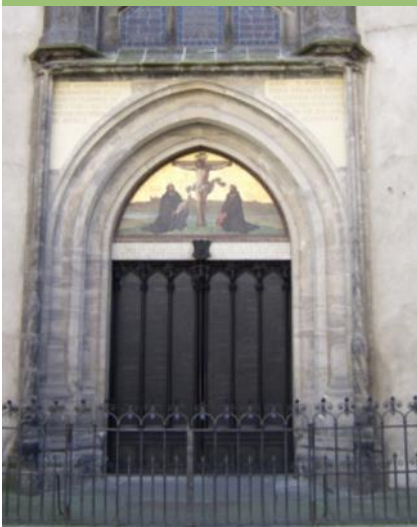
Castle Church Doors