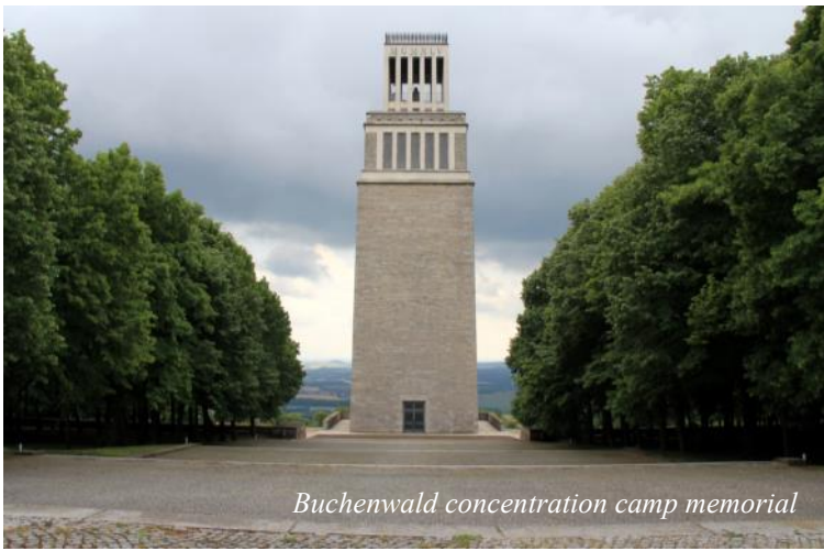
Buchenwald concentration camp memorial

This morning we travel to Wittenberg where our local guide takes us on a tour of Lutherstadt. It was here in 1517 that Martin Luther nailed his famous 95 Theses and Melanchthon helped forge Reformation theology. It is also where the Cranachs painted portraits of Luther. We spend time in the Lutherhalle (Luther House) Museum, where Luther lived first as a monk, then later with his wife and children. We view some of Luther's personal library, rare manuscripts, and early Bibles. The tour also includes Castle Church, Stadtkirche St. Marien (St. Mary's church) where Luther preached and where his children were baptized, and the Luther Oak where he burned the edict from Rome, condemning him as a heretic. We have dinner and overnight in Wittenberg. (B, D)