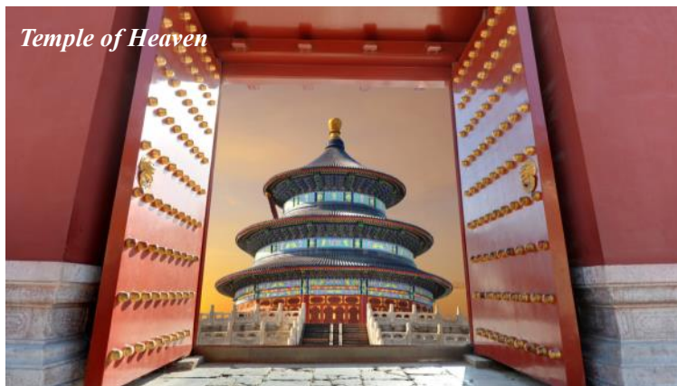
Temple of Heaven

Day 5 • Beijing – Xi'an This morning we transfer to the airport and fly to Xi'an, one of the ancient cities of China. Upon arrival, we meet our local guide and