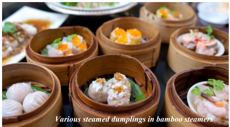
Various steamed dumplings in bamboo steamers

Day 8 • Xi'an – Chengdu This morning we fly to Chengdu, a city famous for its spicy Sichuan cuisine and its leisurely lifestyle. Upon arrival, we visit Jinli Street , a busy commercial street with a history stretching back to the Qin Dynasty. Both sides of the narrow street are occupied by a variety of shops and bars in typical ancient architectural-style buildings. We continue on to visit the Broad Narrow Alley and the People's