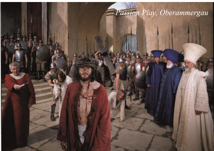
Passion Play, Oberammergau

Abbreviations for Meals B=Breakfast L=Lunch D=Dinner