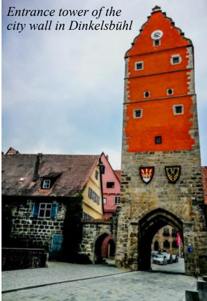
Entrance tower of the city wall in Dinkelsbühl