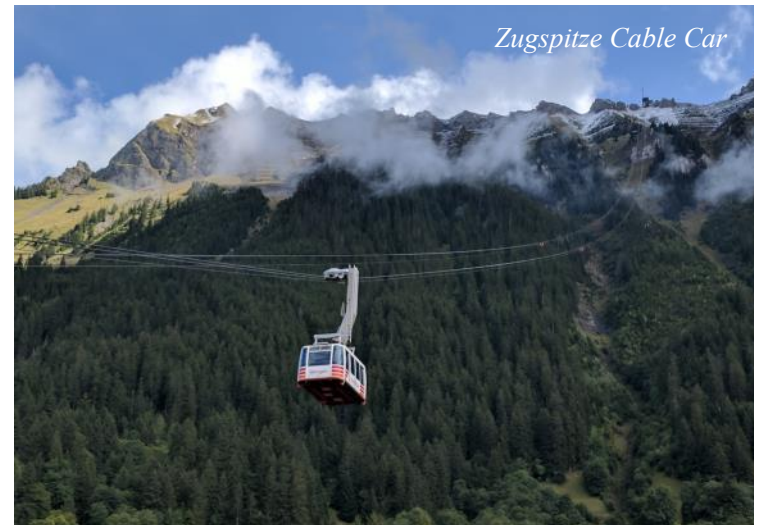
Zugspitze Cable Car

Today we head to Oberammergau. First, we stop at the Monastery of Ettal where we learn how the monks brewed beer and of course sample the beer and cheese. We also visit Linderhof Castle, built by King Ludwig. Built in French