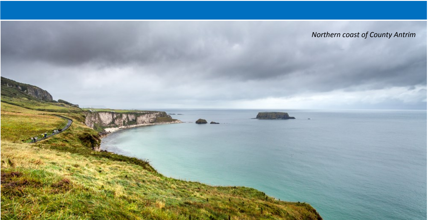
Northern coast of County Antrim

fellowship, interesting pubs and enchanting music, and most importantly, a wealth of new friends! Welcome home! B