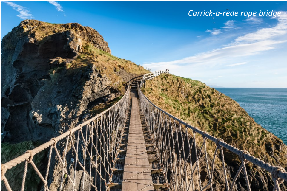
Carrick-a-rède rope bridge