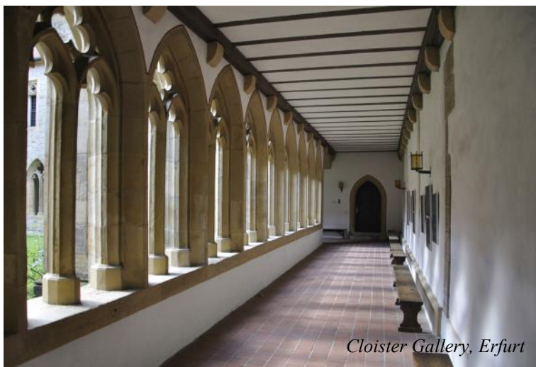
Cloister Gallery, Erfurt

What better way to start the day than with a Rhine cruise! We'll board the boat and sail past magnificent castles and the famous Loreley rock to St. Goar. Every bend in the river brings more stunning scenery, ships pass left & right, and numerous trains roar up and down the Rhine River valley. From there we will drive to