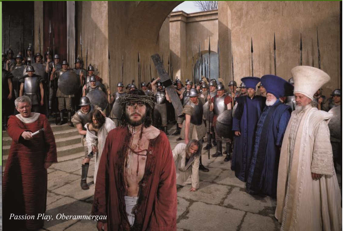
Passion Play, Oberammergau