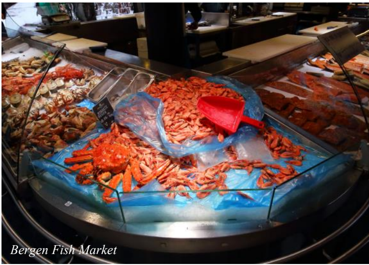
Bergen Fish Market