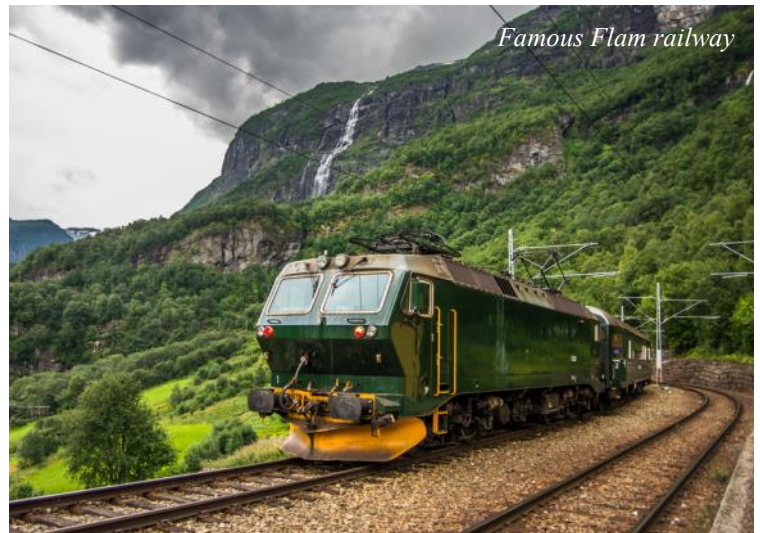
Famous Flam railway

of football legend, Knute Rockne, who was born here. We then continue on toward Stalheim and ascend the narrow hairpin turns of the Stalheim Canyon Road to the Stalheim Hotel. This historic hotel boasts the finest view in Norway and is a nice stop for lunch. We move on to Flåm, on the shore of the Aurlandsfjord. Here we board the world famous Flåm train and enjoy a round trip ride on one of the world's most scenic railways. Later this afternoon, we travel through the Lærdal Tunnel, the world's longest road tunnel, and cross the mighty Sognefjord, en route to one of the most beautiful hotels in all of Norway, Kvikne's Hotel in Balestrand. B,D