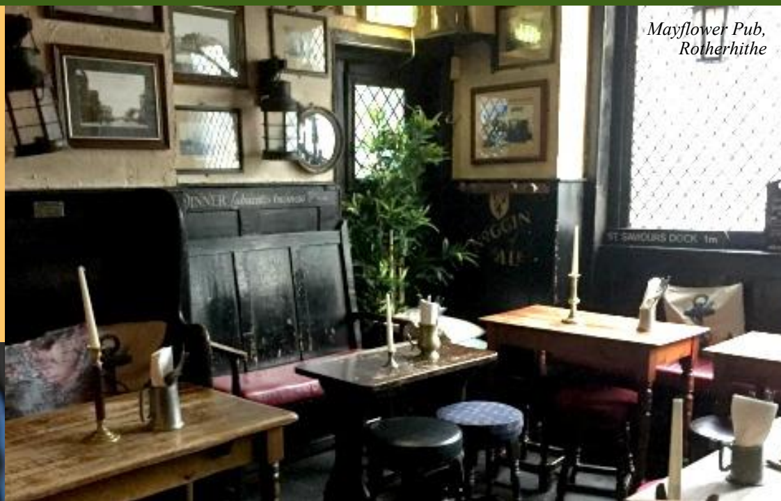
Mayflower Pub, Rotherhithe