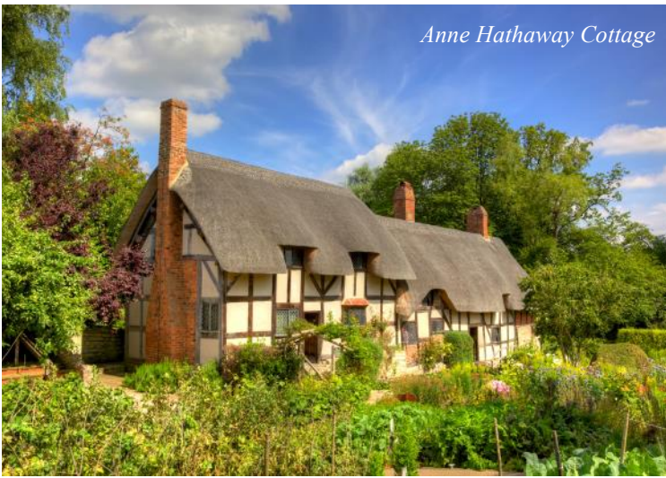
Anne Hathaway Cottage

Cotton urged members of his congregation to join the Massachusetts Bay Company, and he helped found the city of Boston in the 1630s. The Puritan Path leading to the church is in his honor. We will have lunch in Boston, then continue our journey into London and the evening will be at leisure. Tickets to a West End show can be arranged. (B/L)