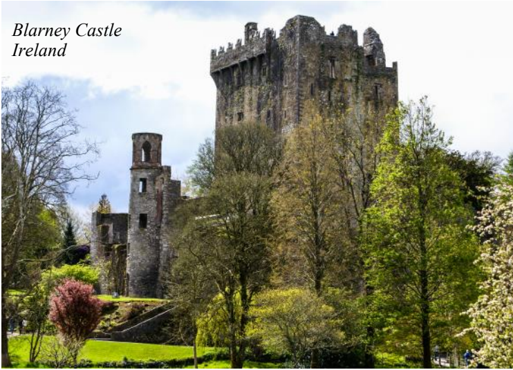
Blarney Castle Ireland

Each day begins with a brief devotional thought and a prayer.