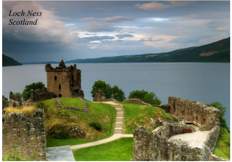
Loch Ness Scotland

Our journey proceeds as we travel to Dublin. The first stop includes a visit to Blarney Castle. Of course, you will want to kiss the Blarney Stone and acquire the "gift of eloquence." Next, we see the Rock of Cashel , also known as St Patrick's Rock. Towering over the town from its perch on a 200-foot-high outcrop of limestone, the Rock was once the seat of the Kings of Munster. It was visited by St. Patrick in 450 A.D. and by Brian Boru, the last great High King of Ireland. Today the impressive stone walls enclose a round tower, the Cathedral, a 12th century Romanesque chapel, high crosses and other structures. B/D