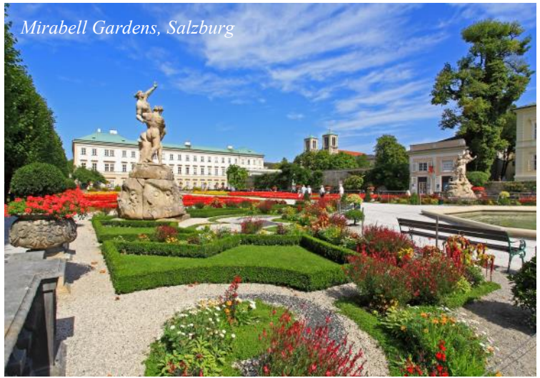
Mirabell Gardens, Salzburg