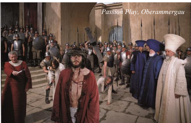
Passion Play, Oberammergau

Abbreviations for Meals B=Breakfast L=Lunch D=Dinner