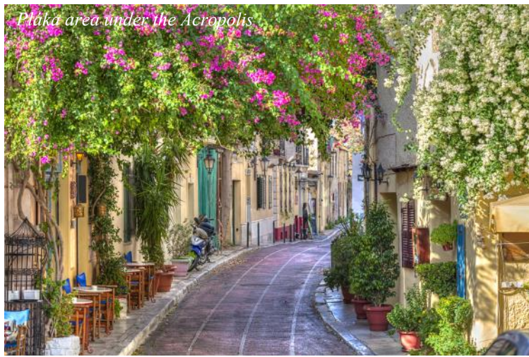
Pláka area under the Acropolis