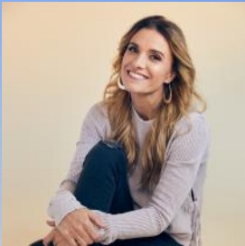
Rebecca St. James