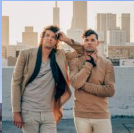
For King & Country