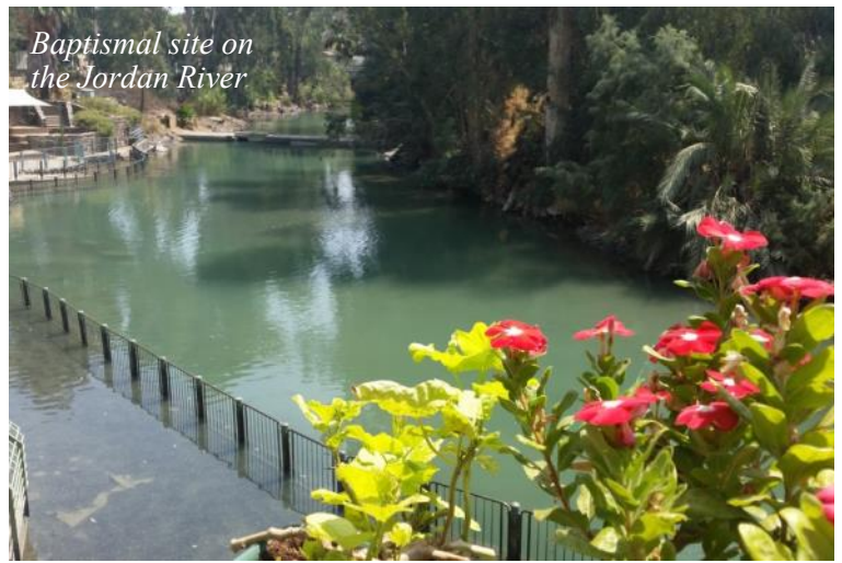
Baptismal site on the Jordan River

Day 1: Sunday, February 9, 2020 • Depart USA Our journey begins as we board our flight to Tel Aviv. IF