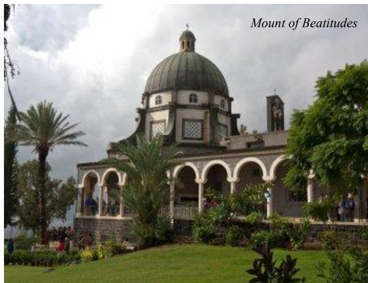
Mount of Beatitudes

On the drive down to the Dead Sea area, we see Qumran where the Dead Sea scrolls were found. We continue to Masada, last fortress of the Jewish zealots during the war with romans. Before we return to Jerusalem, there is the opportunity to swim and float in the Dead Sea. We have dinner at our hotel in Jerusalem. B, D