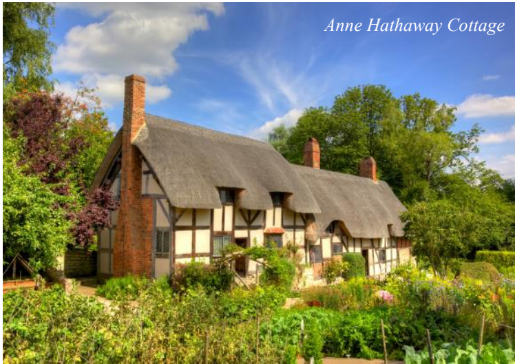
Anne Hathaway Cottage

Cotton urged members of his congregation to join the Massachusetts Bay Company, and he helped found the city of Boston in the 1630s. The Puritan Path leading to the church is in his honor. We will have lunch in Boston, then continue our journey into London and the evening will be at leisure. Tickets to a West End show can be arranged. (B/L)