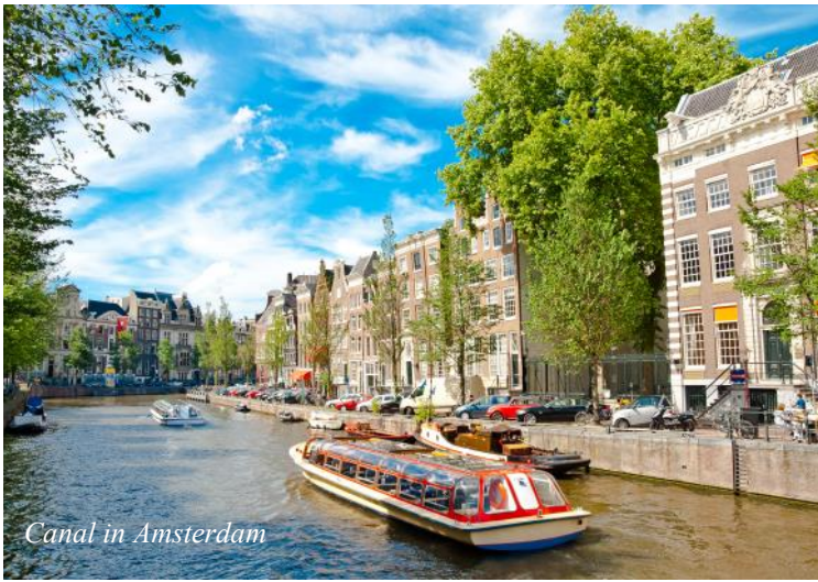
Canal in Amsterdam