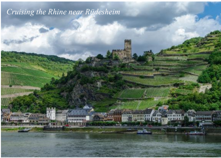
Cruising the Rhine near Rudesheim