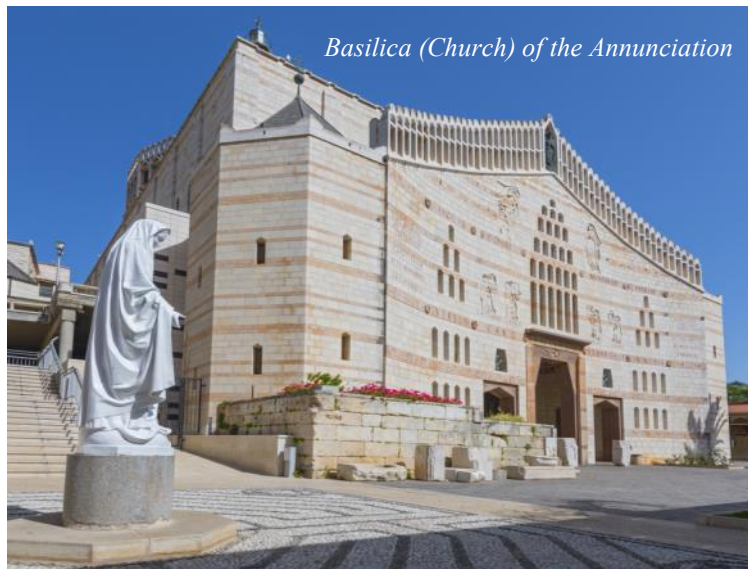
Basilica (Church) of the Annunciation