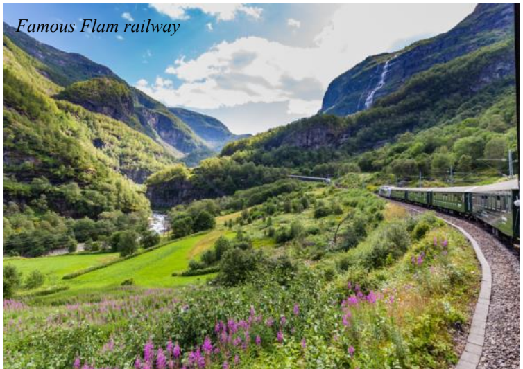
Famous Flam railway

We depart Bergen after breakfast, traveling into the beauty of Norway's fjords. Today is a good day to watch for trolls, as we pass under mountains through dozens of tunnels and cross a few bridges. Our first stop is in Voss, for a chance to have a mid-morning coffee, or perhaps pay homage to the memorial of