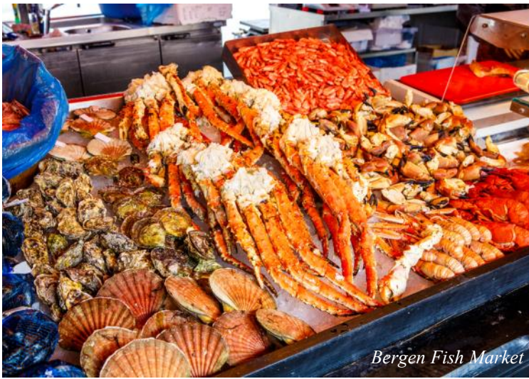
Bergen Fish Market