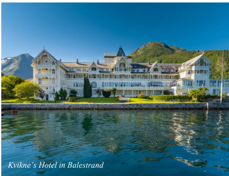
Kvikne's Hotel in Balestrand

This morning we suggest a leisurely walk along the path from our hotel to the Norwegian Fjord center. This walk has 327 steps thru plateaus and high and airy viewpoints and close to the surging Storfossen (waterfalls). There is wild nature but probably not a troll to be seen on this walk. We suggest you do it leisurely.