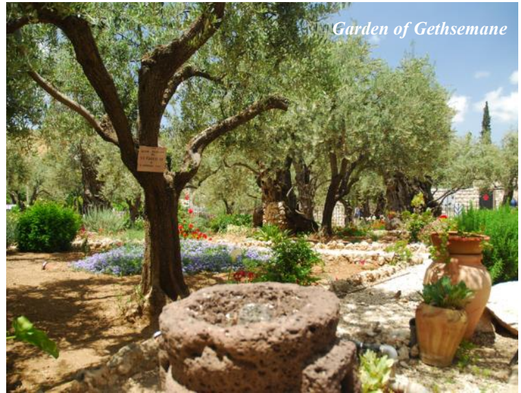
Garden of Gethsemane