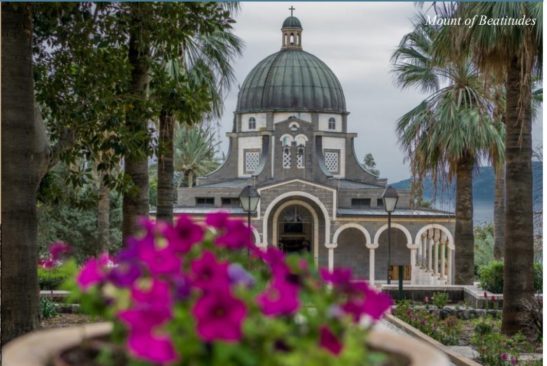
Mount of Beatitudes