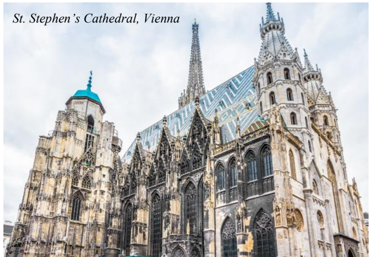
St. Stephen's Cathedral, Vienna

Today we head to Oberammergau, where we enjoy a tour of the town and see the beautiful woodcarvings for which the town is famous. Following lunch (on own), we head to Linderhof Castle, built by King Ludwig. Built in French Rococo style, Linderhof has a Moorish pavilion which can be visited during your one hour stay when join a guided tour of the interior of the castle. Following a castle tour, we drive a short distance to Oberammergau. Once settled in our Oberammergau hotel, we have dinner together with free time in the evening! B, D