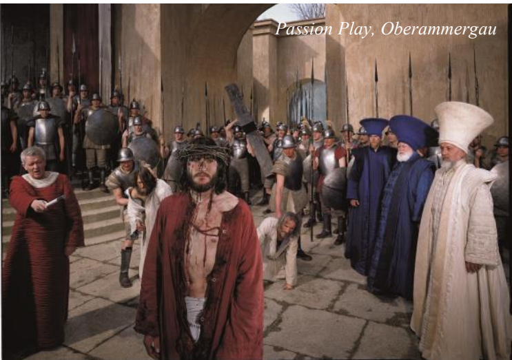
Passion Play, Oberammergau

Abbreviations for Meals B=Breakfast L=Lunch D=Dinner