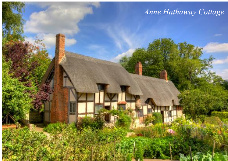
Anne Hathaway Cottage

arrested and taken to the Guildhall. We will see the cells where they were held in the Guildhall. St. Botolph's Church, known as "Boston Stump," is one of England's largest parish churches. Rev. John Cotton urged members of his congregation to join the Massachusetts Bay Company, and he helped found the city of Boston in the 1630s. The Puritan Path leading to the church is in his honor. We will have lunch in Boston, then continue our journey into London and the evening will be at leisure. Tickets to a West End show can be arranged. (B/L)