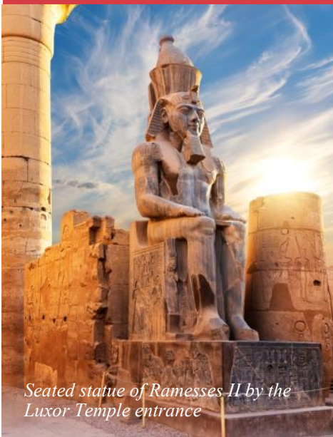
Seated statue of Ramesses II by the Luxor Temple entrance