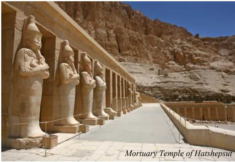
Mortuary Temple of Hatshepsut

massive sandstone columns built by Ramses II and see the sacred lake and many temples. We visit the temple of Luxor before returning to our ship. B/L/D