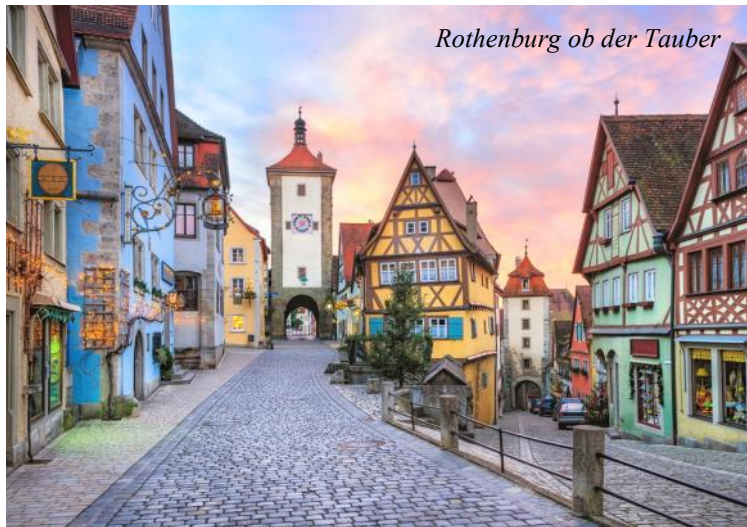
Rothenburg ob der Tauber

Ludwig's royal castles. Perched majestically on a mountainside, this was his fantasy of a medieval fortress and is often referred to as the "Disney Castle." We also visit the beautiful rococo cloister in Ettal and partake in a cheese tasting. We continue to Oberammergau for overnight. B, D