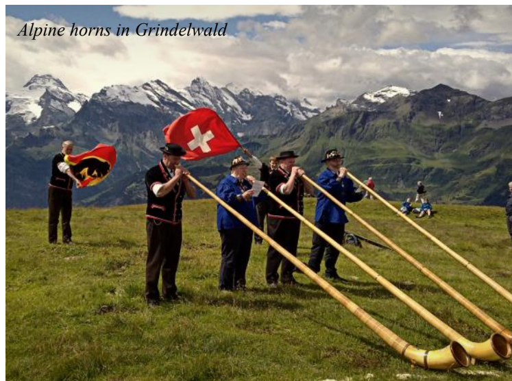
Alpine horns in Grindelwald

A local guide takes us on an excursion via cogwheel train from Lauterbrunnen, the "village of the waterfalls," to the Kleine Scheidegg for a panoramic view of the Eiger, Mönch and Jungfrau Mountains! After time for lunch we continue our train ride down the other side of the mountain to Grindelwald, the "village of the glaciers!" Later we enjoy a Swiss Folklore Show. B, D