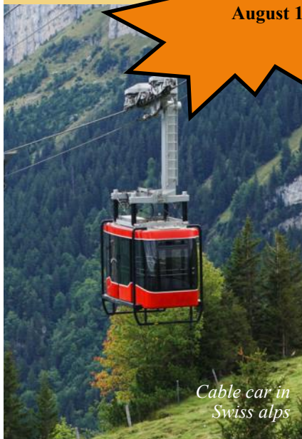
Cable car in Swiss alps