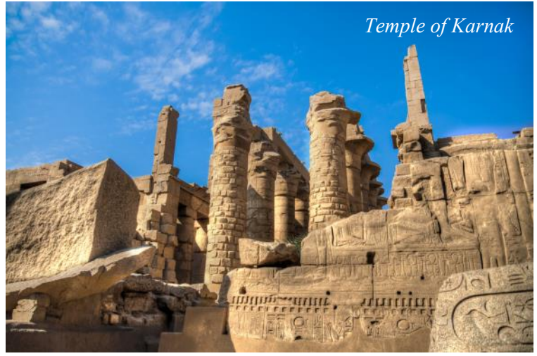
Temple of Karnak

After breakfast we visit the only pyramid complex remains at Sakkara, and the first Pyramid of King Zoser (The Step pyramid, 27th century BCE) and a tomb at Sakkara, the necropolis of pharaohs during the Old Kingdom as well as the Museum of Imhotep, the first Architect in the world. Then we have lunch at a local restaurant serving authentic Egyptian food before driving to the airport to fly to Luxor. There will be time to relax, swim in one of the complex pools, and have dinner on your own at the hotel. B,L