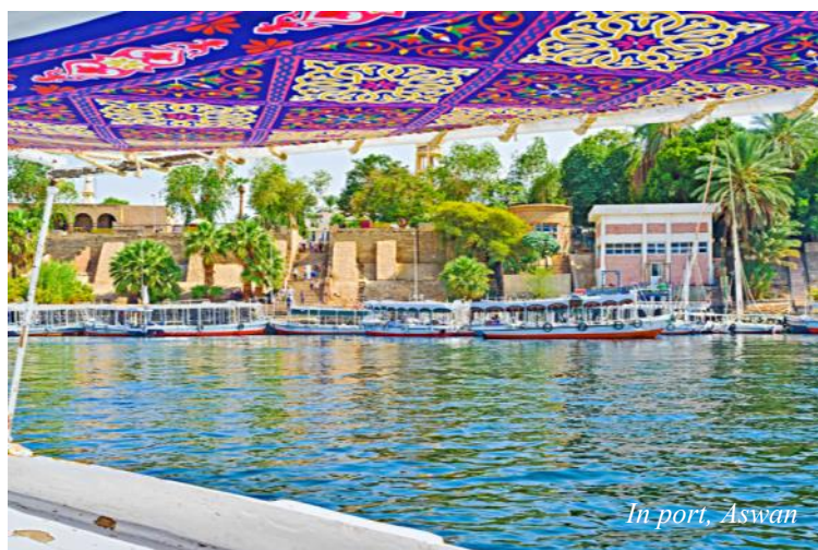
In port, Aswan

In the early morning, we depart to Cairo Int'l Airport for our flights home.