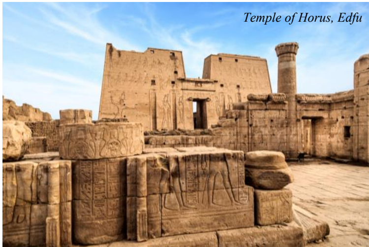
Temple of Horus, Edfu

hall, a collection of columns with fanciful capitals and intricate carvings. We return to the ship and sail to Aswan enjoying the Gallabiyah dinner and party. B,L,D