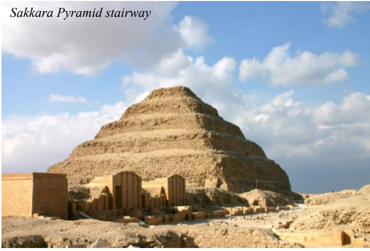
Sakkara Pyramid stairway