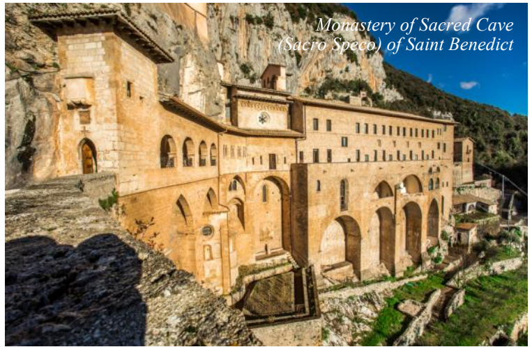
Monastery of Sacred Cave (Sacro Speco) of Saint Benedict

We begin with a walking tour of the Palatine and Capitoline Hills