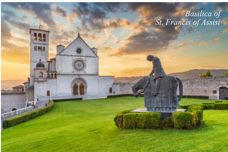
Basilica of St. Francis of Assisi

After breakfast, we drive to Lanciano to celebrate Mass at the Eucharistic Miracle of Lanciano . Later we drive to Assisi and explore the beautiful town. Our local guide shows us its wonderful frescoes by Cimabue and Giotto and more. We have free time to