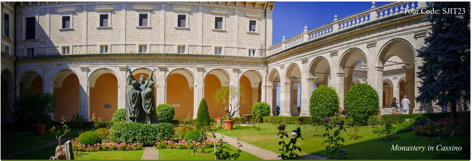
Monastery in Cassino