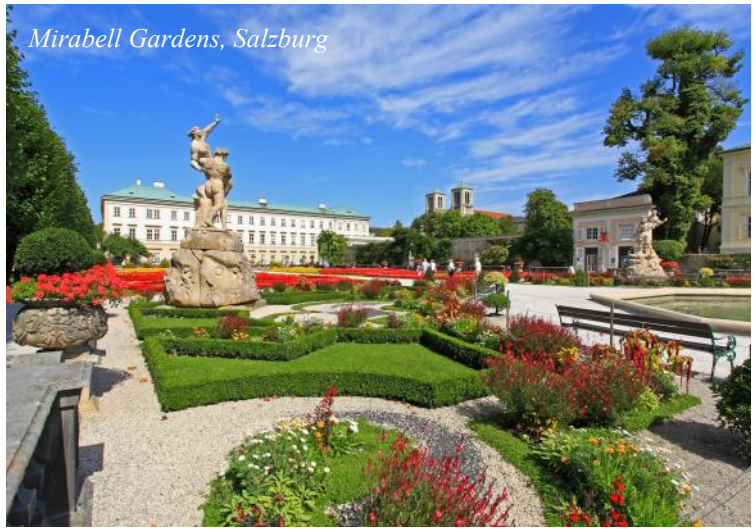
Mirabell Gardens, Salzburg