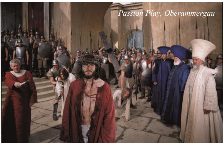
Passion Play, Oberammergau

Regretfully, our adventure comes to an end today. We return with memories of fabulous castles, magnificent alpine landscapes, historic, enchanting cities, a great taste for the European beers and Gemütlichkeit, and a wealth of new friends! "Auf Wiederseh'n!" B