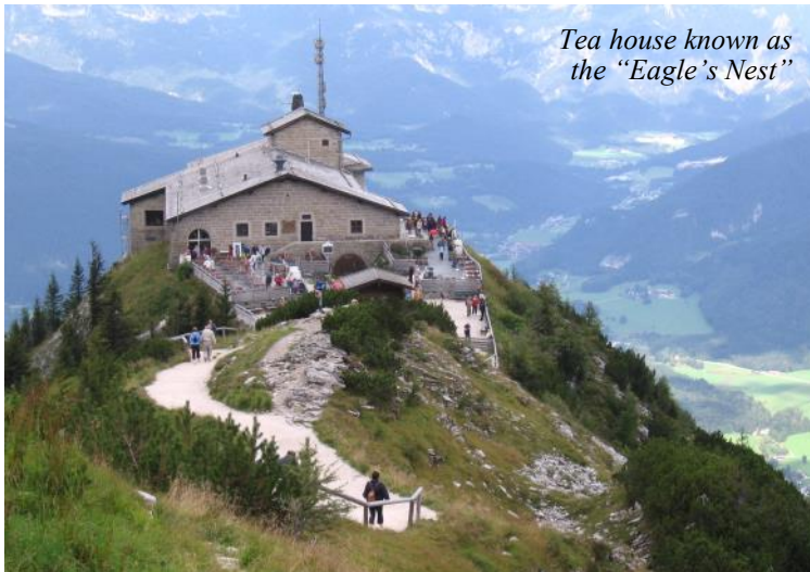
Tea house known as the "Eagle's Nest"