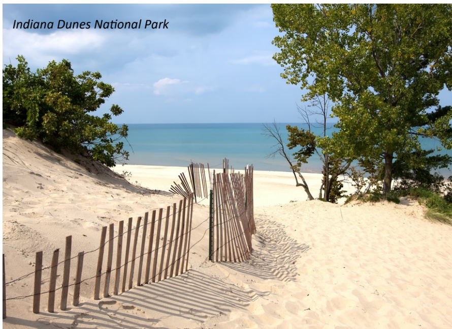
Indiana Dunes National Park

Registration now open! Use QR code below or go to www.tinyurl.com/KACM26