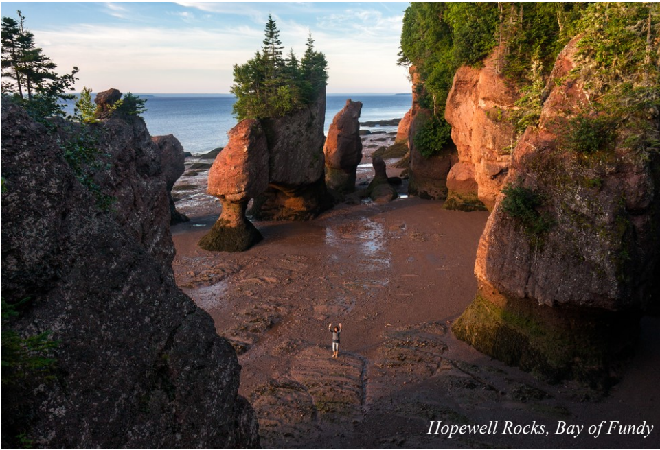
Hopewell Rocks, Bay of Fundy