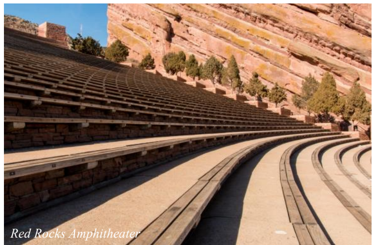
Red Rocks Amphitheater

We start our day at the Red Rocks Park, owned and maintained by the city of Denver as part of the Denver Mountain Parks system. The park is known for its very large red sandstone outcrops. Many of these rock formations within the park have names, from the mushroom-shaped Seat of Pluto to the inclined Cave of the Seven Ladders. Within the park boundaries is the Red Rocks Amphitheater, a world-famous venue used since 1941, which hosts many concerts and other events. Red Rocks Park was also the site of the Start and Finish line of The Amazing Race 9 which aired in the spring of 2006. We head to Tommyknocker Mountain Town Craft Beer for lunch. For more than 20 years, TKB has been passionately crafting award winning ales and lagers. TKB has been awarded over 100 medals from a multitude of local, national, and international competitions. They are a "GREEN" brewery employing a comprehensive recycling program and utilizing renewable energy. Next on our agenda is the Argo Gold Mine & Mill. We see a brief history movie, mining equipment demonstration and are then transported to the top of the property. We have a brief view of the Argo Tunnel before descending through the Argo Mill. Afterwards, we pan for gold. Our final stop is a tour of the Avery Brewing Company, a craft brewery committed to producing eccentric beers that defy style since 1993.