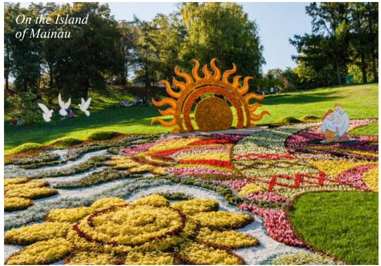
On the Island of Mainau

admire the handsome, half-timbered buildings and walk the narrow, winding cobblestone streets, we realize that we truly are stepping back 500 years in time! Akzent Hotel Schranne or similar, Rothenburg, Germany (B,D)