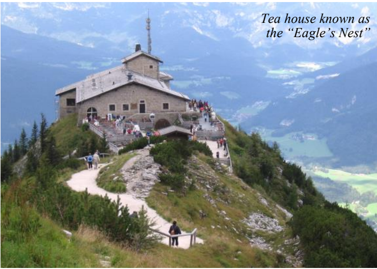
Tea house known as the "Eagle's Nest"

Jesuit Priest, Rupert Mayer, both active in the resistance against the Nazi regime and later martyred, were given refuge here. This afternoon we attend Part One of the Passion Play , the legacy of a vow made by the Oberammergauers in 1633 to enact the Passion story. Due to the ravages of the Thirty Years War, the plague had taken its toll in lives. But many of the people were spared, and the following year, 1634, the first Passion Play was performed on a stage set up in the cemetery. After dinner we attend Part Two. Hotel assigned later, Oberammergau area, Germany (B,L,D)