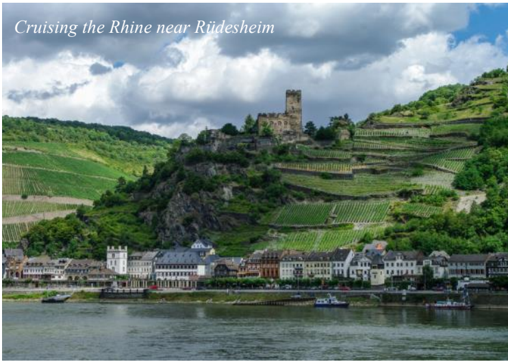
Cruising the Rhine near Rudesheim