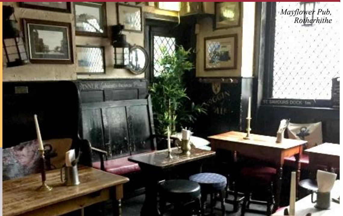
Mayflower Pub, Rotherhithe