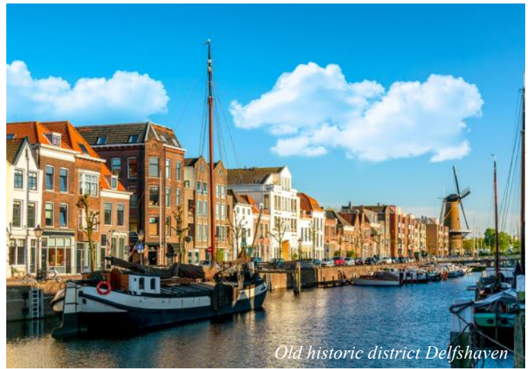
Old historic district Delfshaven

Day 5: Monday, August 31, 2020 • Harwich, Lavenham, Boston, Lincoln Harwich is the port town where Captain Christopher Jones was born. We will visit his recently renovated house, the Guildhall, and the Ha'Penny Pier. We'll have free time for lunch in Lavenham, one of the best-preserved and picturesque medieval villages in England. We will then drive to Boston, a port town on the East coast. In 1607, a group of pilgrims walked 60 miles from Scrooby to Boston to meet a ship to take them to Holland. They were betrayed and instead of a new life, they were arrested and taken to the Guildhall. We will see the cells where they were held in the Guildhall. St. Botolph's Church, known as "Boston Stump," is one of England's largest parish churches. Rev. John Cotton urged members of his congregation to join the Massachusetts Bay Company, and he helped found the city of Boston in the 1630s.