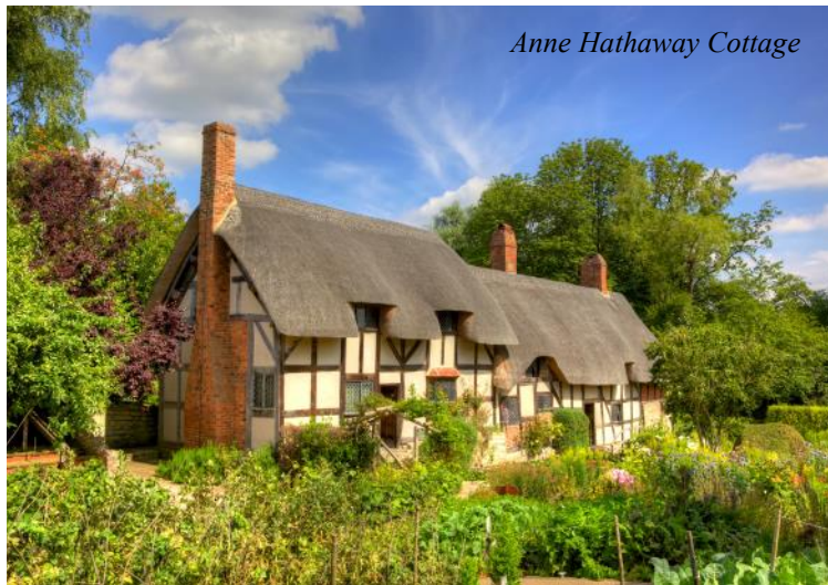
Anne Hathaway Cottage