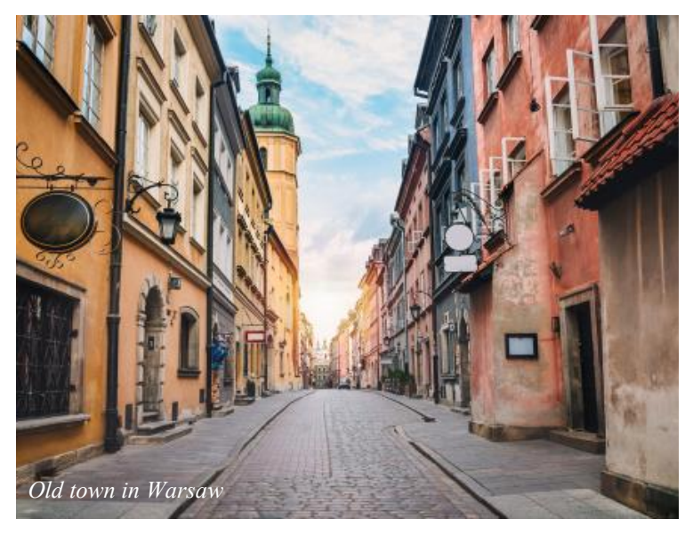
Day 1: Thursday, September 26, 2024 • Departure Our adventure begins with our overnight flights to Warsaw, Poland. (In-flight meals)