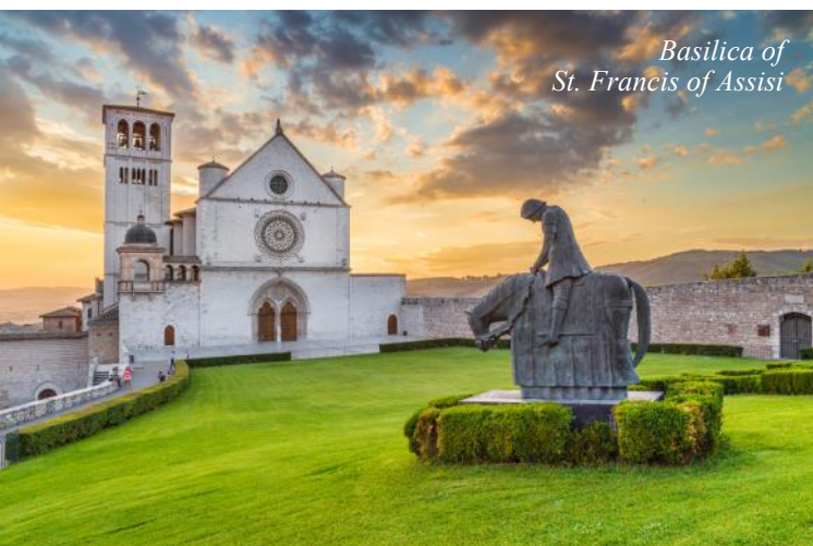
Basilica of St. Francis of Assisi

After breakfast, we drive to Lanciano to celebrate Mass at the Eucharistic Miracle of Lanciano . Later we drive to Assisi and explore the beautiful town. Our local guide shows us its wonderful frescoes by Cimabue and Giotto and more. We have free time to explore the Basilica of St. Clare on our own. St. Clare was Francis' friend and foundress of the Poor Clare nuns. We see the crucifix that spoke to St. Francis in San Damiano. B, D