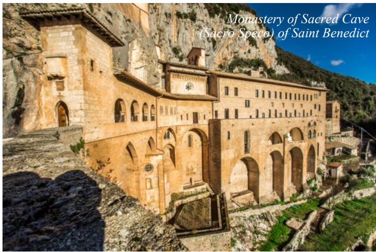
Monastery of Sacred Cave (Sacro Speco) of Saint Benedict

Today we explore the Rieti Valley where St Francis found refuge from the vanities of the world. He found kind, simple people who understood his message. He found lush and peaceful nature. Saint Francis made the Rieti Valley his home along with Assisi and La Verna. Since then, this splendid plain amidst the hills and mountains has been known as the Sacred Valley . Other stops include Greccio where we visit the Sanctuary (one of four shrines built by St Francis) and the International Museum of the Crib and other sites as time permits. We arrive in Rome in time for dinner at our hotel. B, L, D