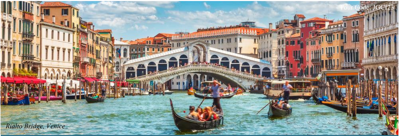
Rialto Bridge, Venice