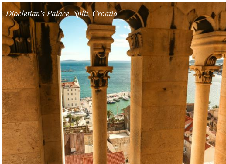
Diocletian's Palace, Split, Croatia

St. Domnius Cathedral , the oldest Catholic cathedral in the world that remains in use in its original structure. The site also features a baptistery, an impressive square and a cellar that was featured in the Game of Thrones television series and the Temple of Jupiter . We continue through the Old Town , a maze of streets and cobblestoned lanes with cafés, restaurants, and small shops. There is free time to visit the Green Market, relax at People's Square and stroll along the Riva , Split's famous promenade lined with palm trees and colorful buildings and great views of the Adriatic Sea. Dinner is on your own. B