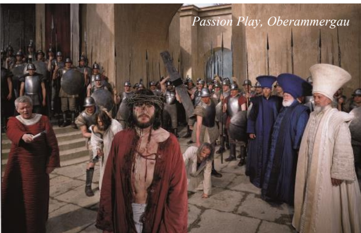
Passion Play, Oberammergau

Abbreviations for Meals B =Breakfast L =Lunch D =Dinner