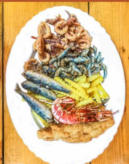
National dish of Croatia - Adriatic fried fish