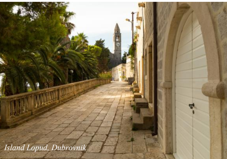
Island Lopud, Dubrovnik

We check out from our hotel this morning and travel up north to Split, a town on the Dalmatian Coast. We stop along the way and explore a village in the countryside and perhaps taste local