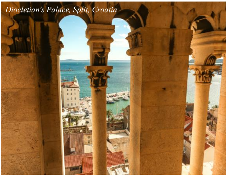
Diocletian's Palace, Split, Croatia