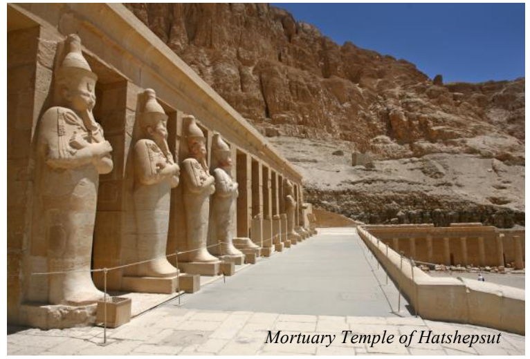
Mortuary Temple of Hatshepsut