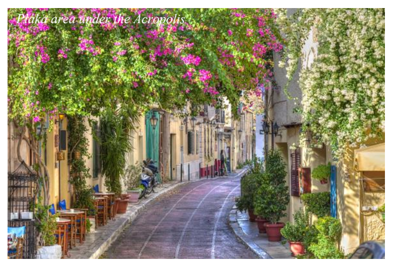
Day 1: Thursday, April 18, 2024 • Depart Our adventure starts today as we depart the USA on our scheduled flight to Athens, Greece.