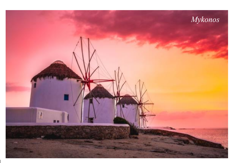
"volta" (take a stroll) along the cobblestone streets with the locals this evening. B/D

This morning we head to the stunning Corinth Canal, an engineering marvel that connects the Aegean Sea to the Ionian Sea. A short distance from here, we tour the archeological site of Ancient Corinth, with its Greek and Roman ruins. Our day continues with a visit to see the ruins of the palace Mycenae and the Tomb of Clytemnestra. After lunch in the nearby town of Mykines, we drive to Epidavros, whose famous 4th-century BC theatre has near perfect acoustics. Our destination is the resort town of Navplio with its well-preserved old town. There is an opportunity to