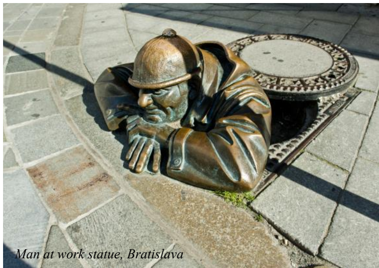
Man at work statue, Bratislava

Wenceslas Square, enjoying Prague's liveliest street scene along the way. Dinner this evening is on our own. B