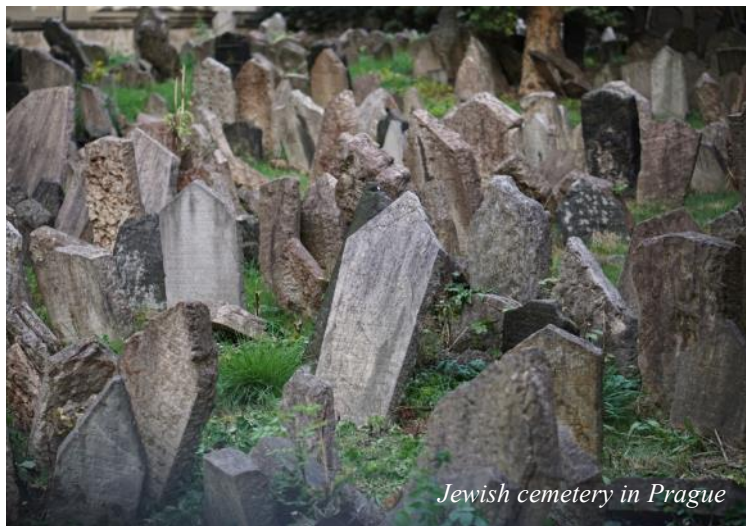
Jewish cemetery in Prague

Day 1: Tues., Aug. 25, 2020 • Depart USA We begin our journey with a flight to Prague.