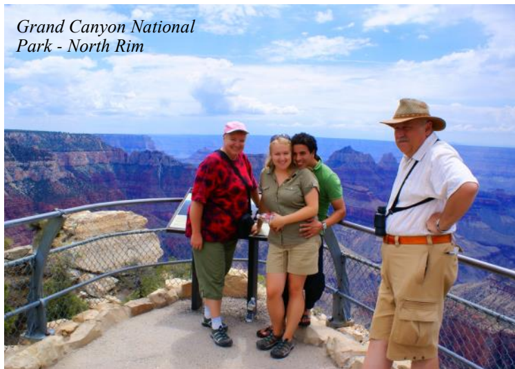
Grand Canyon National Park - North Rim

Bryce Canyon National Park for sightseeing and optional hiking. The hues and intricate shapes of Bryce Canyon carry even the most mature adult away into a fairyland fantasy. The Paiute Indians used a word to describe that translates into, "red rocks standing like men in a bowl-shaped canyon." Mormon settler Ebenezer Bryce, for whom the canyon was named, described it as "a hell of a place to lose a cow." After an afternoon of exploration, check into the hotel located just outside the park. then join the group for a wonderful dinner at the Stone Hearth Grill in nearby Tropic. (B, L, D)