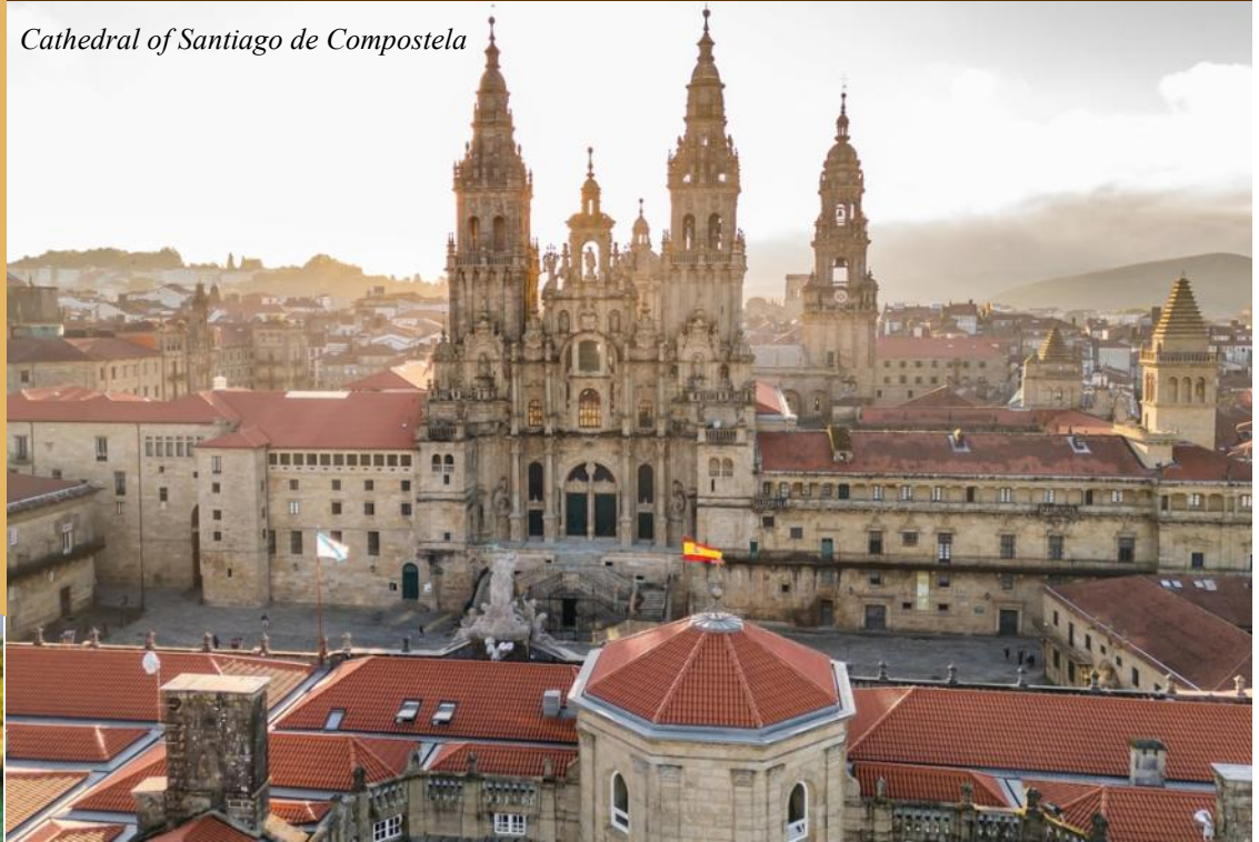
Cathedral of Santiago de Compostela