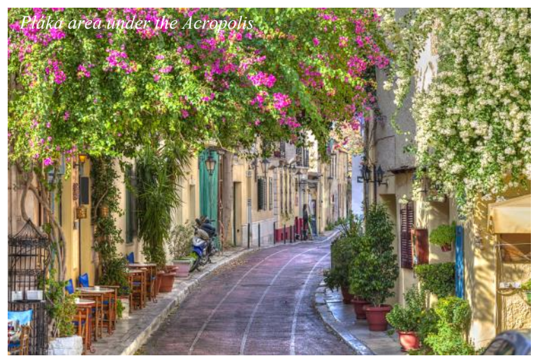
Day 1: Thursday, September 18, 2025 • Depart Our adventure starts today as we depart the USA on our scheduled flight to Athens, Greece.