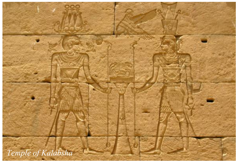
Temple of Kalabsha

Enjoy a relaxing breakfast on board our boat we set sail for Kalabsha for a visit to the Kalabsha Temple. This temple was one of the most important historic monuments that were moved in the mid-20 th century to save them from being submerged by the construction of the Aswan Dam. We