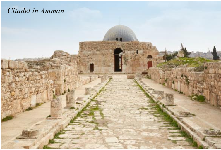
Citadel in Amman