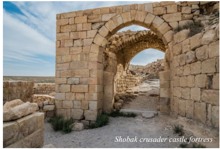
Shobak crusader castle fortress