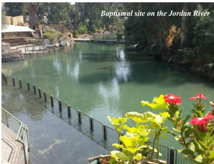
Baptismal site on the Jordan River

Day 1: Friday, March 27, 2020 • Depart USA We begin our pilgrimage with a flight from Minneapolis.