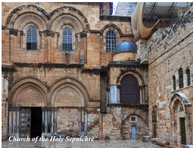
Church of the Holy Sepulchre